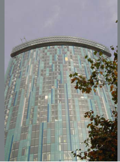
Beetham Tower Birmingham