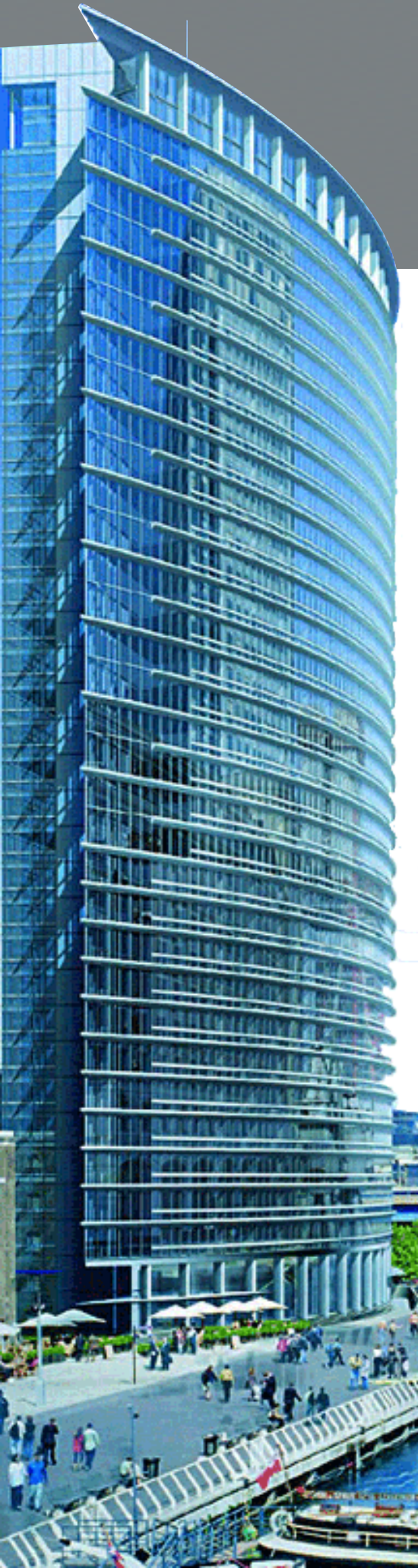
West India Quay, London.